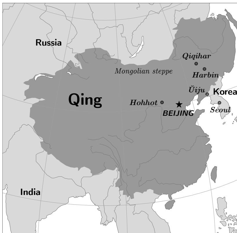
Map of the Qing dynasty (circa 1760)

△ Manchu belongs to the Tungusic family. It was spoken by the Manchu tribes in the historical region of Manchuria in Northeast Asia. It was one of the official languages of the Qing empire, which was founded by the Manchus. With the passing of time, Manchu has been gradually replaced by Chinese, leaving only a few dozen native speakers in the current days.